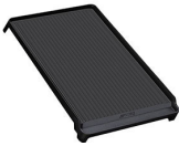
BGTR9 Cast iron grill plate suitable for 60 cm induction cookers