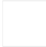
BLF03PGSA Pastel green