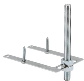
STABMIX Tap stabiliser