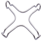
GRM Coffee machine support