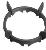
WOKGHU Cast iron WOK Support