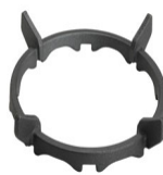
WOKGHU Cast iron WOK Support