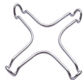
GRM Coffee machine support