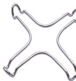
GRM Coffee machine support