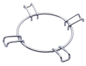
GRW Wok support