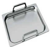
TPK Stainless steel grill plate to cook Teppanyaki dishes