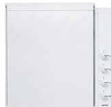
7520EB White cover suitable for 60 cm side control hobs.