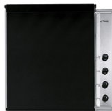
7520NE Black cover suitable for 60 cm side control hobs.