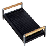
BB3679 Cast Iron griddle