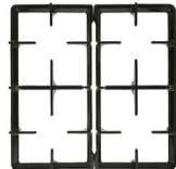
GRC60 Cast Iron pan stands suitable for 60 cm hobs.