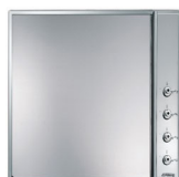
7520X Glass cover suitable for 60 cm side control hobs.