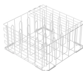
WB50PG5 Wire basket with flat bottom for 25 plastic glasses, max. H 230 mm, min.-max. Ø 36-95 mm, dim. (WxDxH) 500x500x260 mm