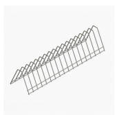
WH00S01 Wire insert for 17 small dishes, width 100 mm, for flat bottom baskets 500x500 and 600x500 mm