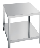
WS5 Estrutura inferior para máquina de lavar copos e máquina de lavar louça 500