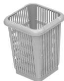
PHOOS01 Polypropylene single basket for cutlery