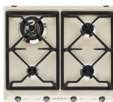
SR964PGH Colour: Cream