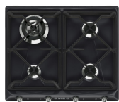
SR964NGH Colour: Black