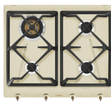
SRV864POGH Colour: Cream