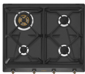
SRV864AOGH Colour: Anthracite