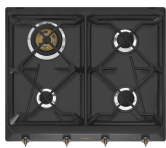
SRV864AOGH Colour: Anthracite