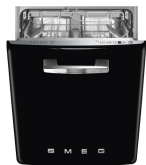
STFABBL3 Colour: Black