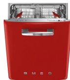
STFABRD3 Colour: Red